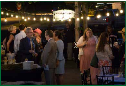
Night at the Races - Courtyard