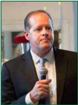
Senator Cam Ward