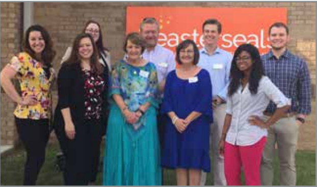
Montgomery Clinic located in Easterseals new building. An Open House was held in August.