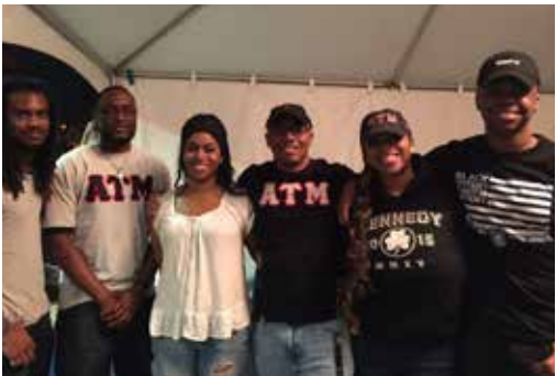
Tuskegee University Fraternity volunteers