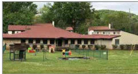
Anniston Clinic on Powers Ave.