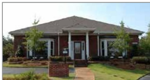
Birmingham Clinic on Cahaba Valley Drive