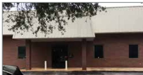
Mobile Clinic on Able Court