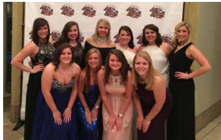
Alpha Xi Delta ladies

The Learning Tree relies on special event fundraisers to continue important services for children. Thank you to everyone who helped make the Gala a success. We hope to see you again next year!