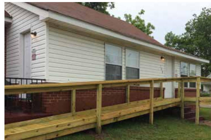
New ramp at a Learning Tree group home in Tallassee.