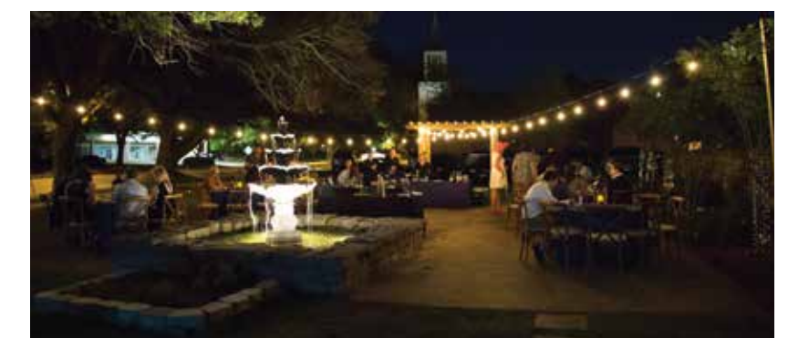
The Pillars courtyard after dark