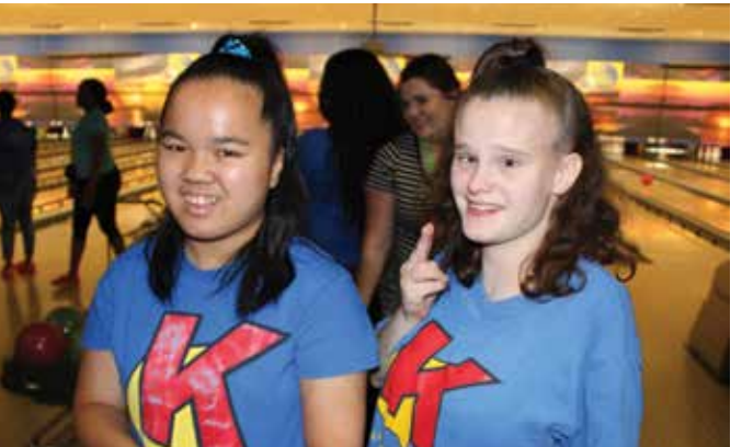
Kilborn’s Kids bowling