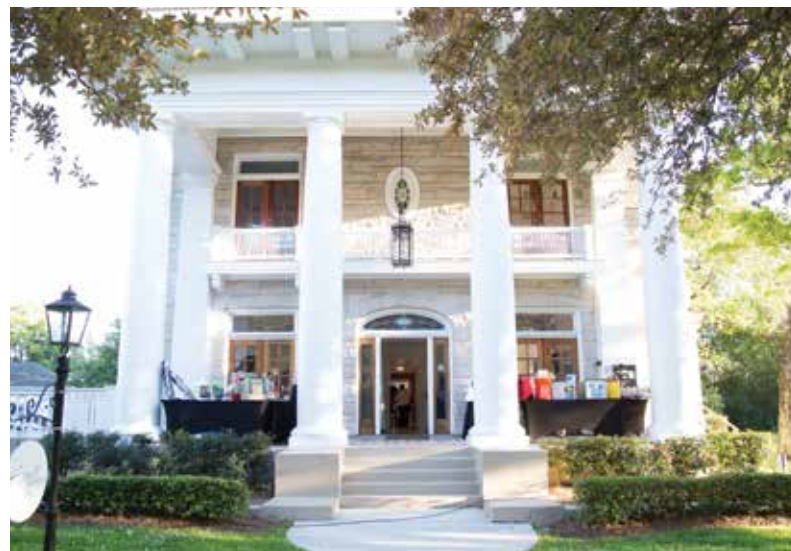
The Pillars of Mobile