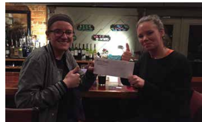
Journey Ticket Winner