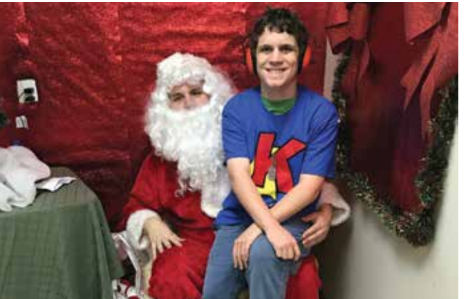
Kilborn’s Kids Christmas