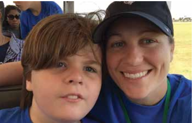
Kilborn’s Kids duck boat tour